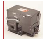
Model FDC 1/2, 1 HP