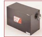
Model FDCL 1/2 HP