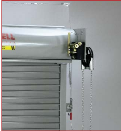
Mechanism cover included, but not shown in photo for clarity.

EZ Test 'n Set is a combination chain operator / controlled closing system that eliminates the need for complex spring release mechanisms and complicated reset procedures. The door is held open by a unique locking mechanism that is tied into a factory supplied padlockable guide mounted test handle and fuselink arrangement. Using the test handle or melting of the fusible link releases the locking mechanism, disengages the hand chain operator and engages the adjustable governing mechanism, all part of a compact operating and closing system. The door will close at a controlled rate of descent not to exceed 9" per second. To reset for normal