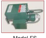
Model FS 1/3, 1/2, 3/4, 1 1/2, 2, 5 HP

M100 System operators are always capable of closing the door in the event of a fire emergency and eliminate the need for mechanical resetting.